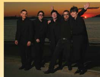
Sun Kings 8/12