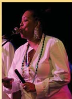
CHELLE! & Friends 7/22