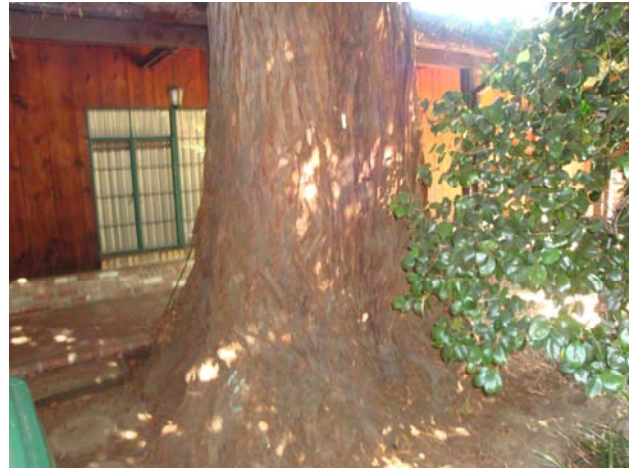
Base of Redwood Tree