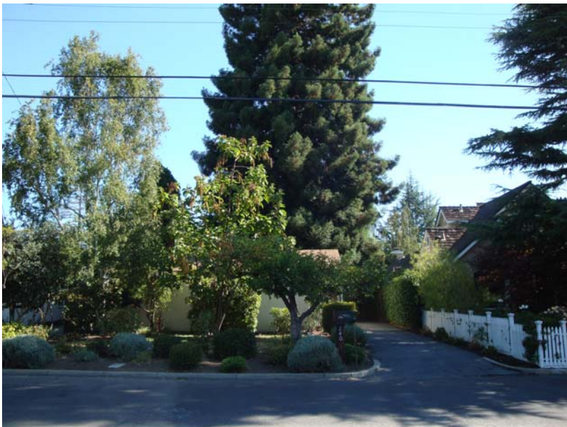
View from University Ave.