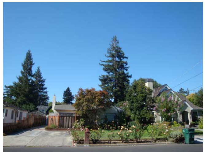
View from across the street of