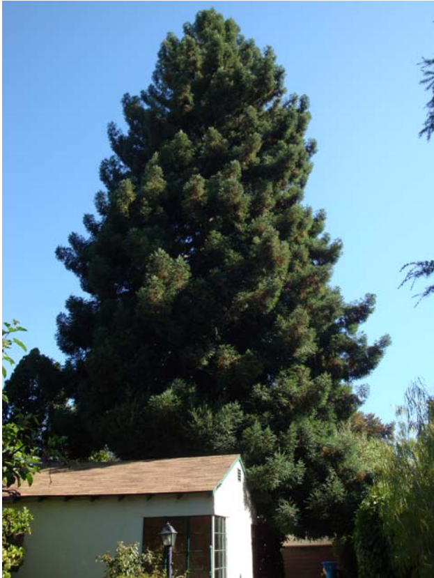
Existing Home with Redwood Tree